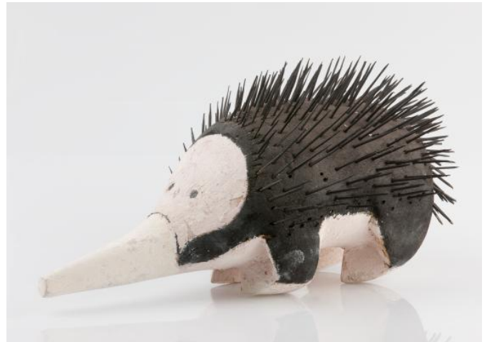
Image: Rowan Pootchemunka (Wik Indigenous People of Queensland, Australia). Echidna . 1996-97, Synthetic polymer paint, ochre on wood, Art Gallery of South Australia, Adelaide.

To intersect means to come across another being on their course, to occasionally even intercept this other. An intersection is the fact or action of crossing another or the place where two beings (or things) come cross each other. In our multispecies world, it is inevitable that animal and human life intersect, sometimes in rather calculated ways, sometimes in rather joyous ways and sometimes by a haphazard chance.